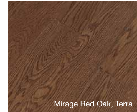
Mirage Red Oak, Terra